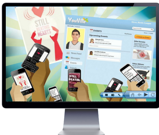
My Digital Life: Interactive Game

My Digital Life: Gaming Simulation - The most memorable learning experiences are the fun ones. That's no exception here, where everything comes together with a final interactive game. In this simulation, students demonstrate their mastery of digital issues – creating a blog, managing a social networking site, solving technology problems, and working to resolve a cyberbullying situation.